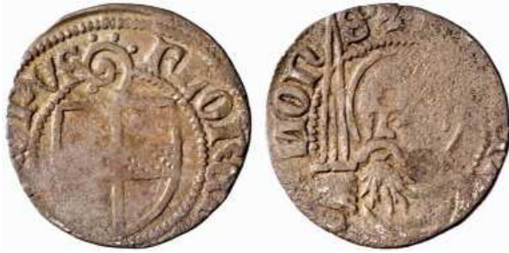
Münster, Bishopric Florenz von Wevelinghofen, 1364-1379.