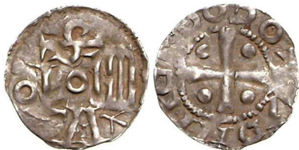
Münster, Bishopric Anonymous Issue of 10th-11th Centuries