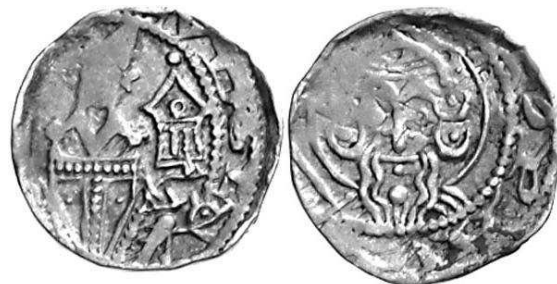
Münster, Bishopric Probable issue of Otto I. von Oldenburg, 1203-1218

Estimation: DM 250. Price realized: 200 DEM (approx. 93 U.S. Dollars as of the auction date)