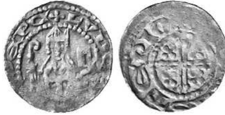
Münster, Bishopric Ludolf von Holte, 1226-1248.

Estimate: 75,00 EUR. Price realized: 125 EUR (approx. 151 U.S. Dollars as of the auction date)