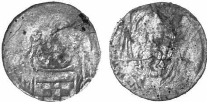
Münster, Bishopric Adolf von der Mark, 1357-1363.