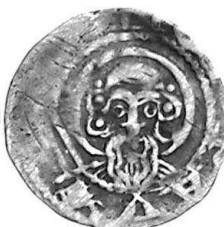
Münster, Bishopric Ludolf von Holte, 1226-1248.