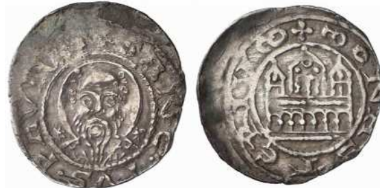
Münster, Bishopric Probable issue of Otto I. von Oldenburg, 1203-1218

Estimate: 100,00 EUR. Price realized: 250 EUR (approx. 302 U.S. Dollars as of the auction date)