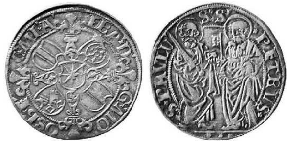
Münster, Bishopric Franz von Waldeck, 1532-1553.

Estimate: 1,500,00 EUR. Price realized: 2,100 EUR (approx. 2,539 U.S. Dollars as of the auction date)