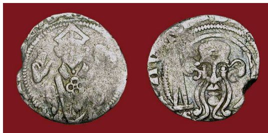
Münster, Bishopric Ludwig II v. Hessen, 1310-1357