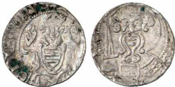
Münster, Bishopric Florenz von Wevelinghofen, 1364-1379.

Estimate: 40 EUR. Price realized: 100 EUR (approx. 128 U.S. Dollars as of the auction date)