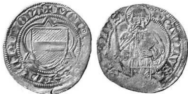
Münster, Bishopric Heinrich von Schwarzburg, 1466-1496.