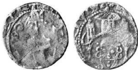
Münster, Bishopric Ludolf von Holte, 1226-1248.

Estimate: 75,00 EUR. Price realized: 60 EUR (approx. 73 U.S. Dollars as of the auction date)