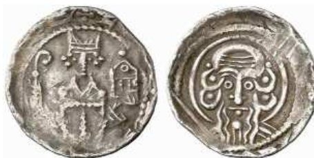
Münster, Bishopric Ludolf von Holte, 1226-1248.

Estimate: 250 EUR. Price realized: 270 EUR (approx. 325 U.S. Dollars as of the auction date)