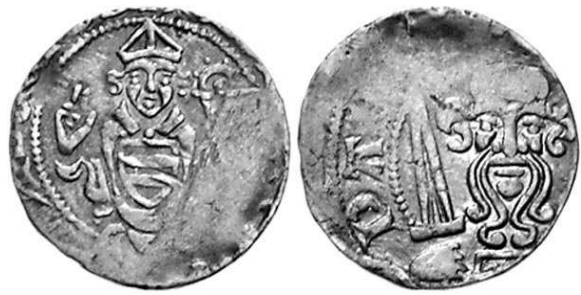
Münster, Bishopric Florenz von Wevelinghofen, 1364-1379.

Estimate: 125 EUR. Price realized: 100 EUR (approx. 141 U.S. Dollars as of the auction date)