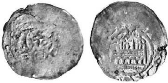
Münster, Bishopric Probable issue of Otto I. von Oldenburg, 1203-1218