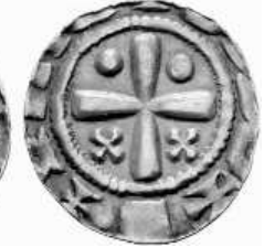
Münster, Bishopric Anonymous Issue of 12th Century