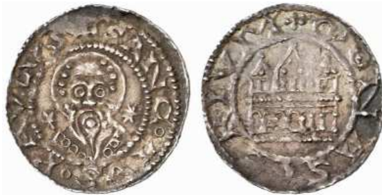
Münster, Bishopric Probable issue of Otto I. von Oldenburg, 1203-1218