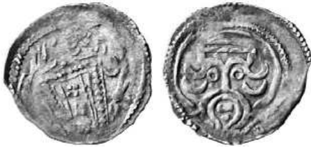
Münster, Bishopric Ludwig II v. Hessen, 1310-1357