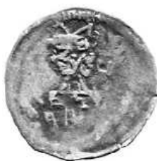
Münster, Bishopric Eberhard von Diest, 1275-1301.