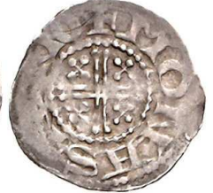
Münster, Bishopric Ludolf von Holte, 1226-1248.