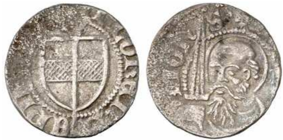
Münster, Bishopric Florenz von Wevelinghofen, 1364-1379.

Estimate: 75 EUR. Price realized: 60 EUR (approx. 85 U.S. Dollars as of the auction date)