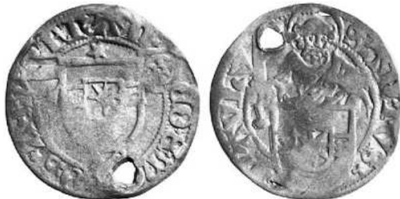
Münster, Bishopric Franz von Waldeck, 1532-1553.

Estimate: 1,000,00 EUR. Price realized: 2,700 EUR (approx. 3,264 U.S. Dollars as of the auction date)