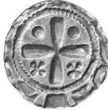
Münster, Bishopric Anonymous Issue of 12th Century