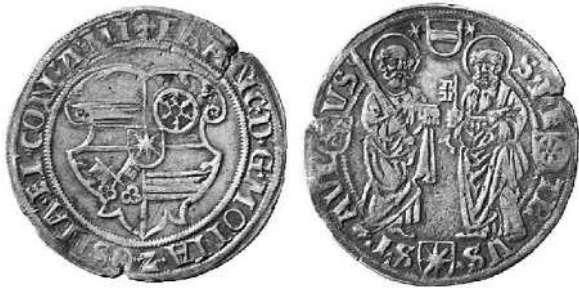
Münster, Bishopric Franz von Waldeck, 1532-1553.