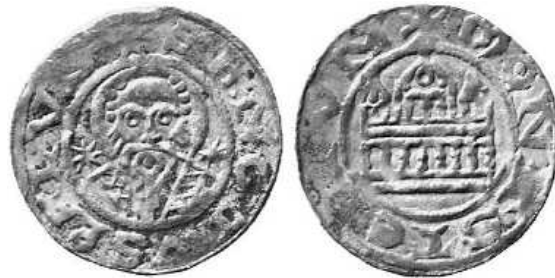
Münster, Bishopric Probable issue of Otto I. von Oldenburg, 1203-1218

Estimate: 200 EUR. Price realized: 340 EUR (approx. 479 U.S. Dollars as of the auction date)