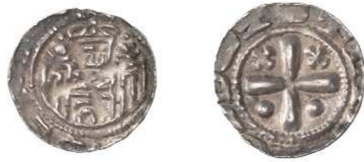
Münster, Bishopric Hermann II. von Katzenelnbogen, 1174 - 1203.

Estimate: 200,00 EUR. Price realized: 550 EUR (approx. 665 U.S. Dollars as of the auction date)