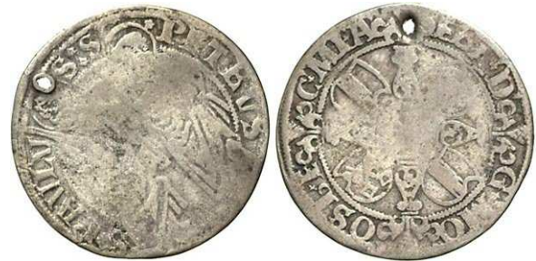
Münster, Bishopric Franz von Waldeck, 1532-1553.

Estimate: 100,00 EUR. Price realized: 170 EUR (approx. 206 U.S. Dollars as of the auction date)