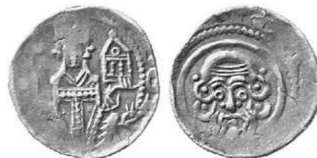
Münster, Bishopric Ludolf von Holte, 1226-1248.

Estimate: 75 EUR. Price realized: 180 EUR (approx. 254 U.S. Dollars as of the auction date)