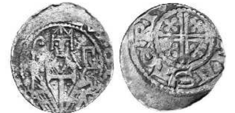
Münster, Bishopric Ludolf von Holte, 1226-1248.

Estimate: 125,00 EUR. Price realized: 120 EUR (approx. 160 U.S. Dollars as of the auction date)