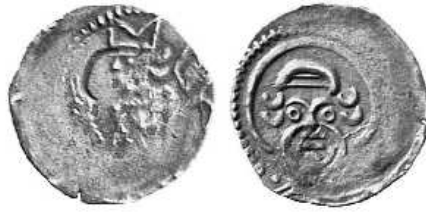
Münster, Bishopric Ludwig II v. Hessen, 1310-1357

Estimate: 100,00 EUR. Price realized: 260 EUR (approx. 314 U.S. Dollars as of the auction date)