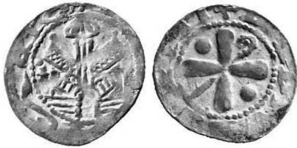
Münster, Bishopric Hermann II. von Katzenelnbogen, 1174 - 1203.