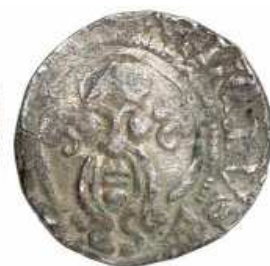
Münster, Bishopric Ludwig II v. Hessen, 1310-1357