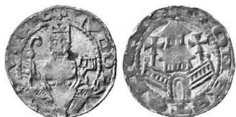
Münster, Bishopric Ludolf von Holte, 1226-1248.

Estimate: 75,00 EUR. Price realized: 95 EUR (approx. 105 U.S. Dollars as of the auction date)