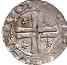
Münster, Bishopric Ludolf von Holte, 1226-1248.