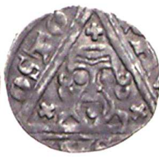
Münster, Bishopric Eberhard von Diest, 1275-1301.