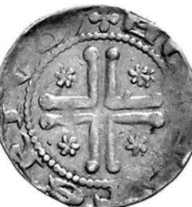
Münster, Bishopric Ludolf von Holte, 1226-1248.