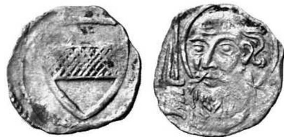
Münster, Bishopric Florenz von Wevelinghofen, 1364-1379.

Schätzpreis: 50,00 EUR. Price realized: 170 EUR (approx. 206 U.S. Dollars as of the auction date)