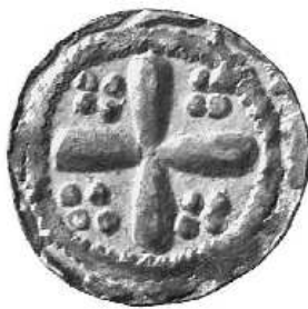
Münster, Bishopric Hermann II. von Katzenelnbogen, 1174 - 1203.