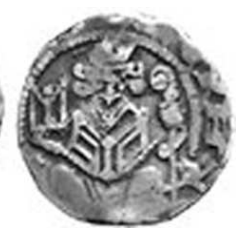
Münster, Bishopric Eberhard von Diest, 1275-1301.