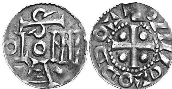
Münster, Bishopric Anonymous Issue of 10th-11th Centuries

Estimate: 150 EUR. Price realized: 170 EUR (approx. 216 U.S. Dollars as of the auction date)