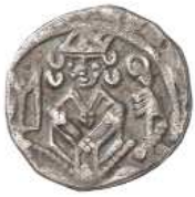
Münster, Bishopric Eberhard von Diest, 1275-1301.