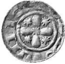
Münster, Bishopric Anonymous Issue of 12th Century