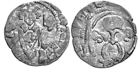
Münster, Bishopric Ludwig II v. Hessen, 1310-1357

Estimate: 100,00 EUR. Price realized: 160 EUR (approx. 214 U.S. Dollars as of the auction date)