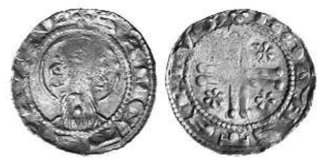
Münster, Bishopric Ludolf von Holte, 1226-1248.

Estimate: 75,00 EUR. Price realized: 170 EUR (approx. 206 U.S. Dollars as of the auction date)