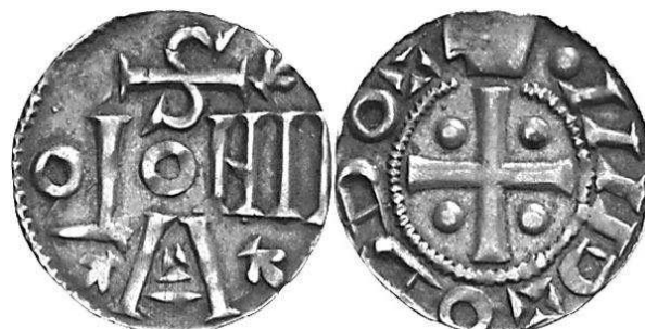
Münster, Bishopric Anonymous Issue of 10th-11th Centuries

Estimate: 100 EUR. Price realized: 270 EUR (approx. 357 U.S. Dollars as of the auction date)