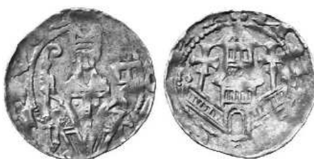
Münster, Bishopric Ludolf von Holte, 1226-1248.

Estimate: 125,00 EUR. Price realized: 140 EUR (approx. 169 U.S. Dollars as of the auction date)