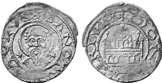
Münster, Bishopric Probable issue of Otto I. von Oldenburg, 1203-1218

Estimate: 100,00 EUR. Price realized: 140 EUR (approx. 169 U.S. Dollars as of the auction date)