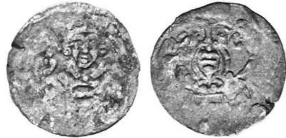
Münster, Bishopric Florenz von Wevelinghofen, 1364-1379.