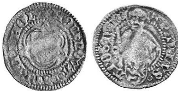
Münster, Bishopric Heinrich von Schwarzburg, 1466-1496.

Estimate: 400,00 EUR. Price realized: 2,900 EUR (approx. 3,506 U.S. Dollars as of the auction date)