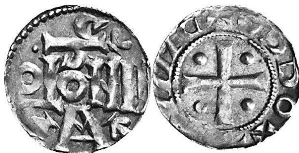
Münster, Bishopric Anonymous Issue of 10th-11th Centuries

Estimate: 150 EUR. Price realized: 200 EUR (approx. 254 U.S. Dollars as of the auction date)