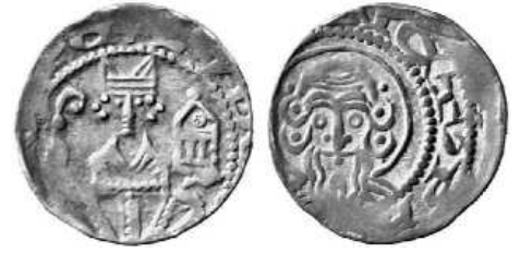
Münster, Bishopric Ludolf von Holte, 1226-1248.

Estimate: 75,00 EUR. Price realized: 160 EUR (approx. 193 U.S. Dollars as of the auction date)