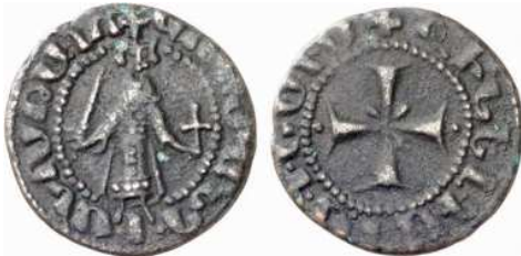
CILICIAN ARMENIA Gosdantin I – 1299