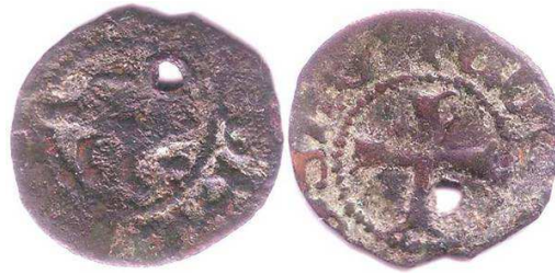
CILICIAN ARMENIA Levon V., 1374-1375.

Estimation: € 100,00. Price realized: 80 EUR (approx. 114 U. S. Dollars as of the auction date)