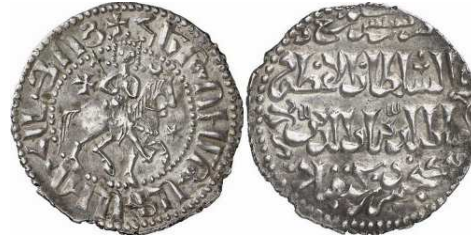
CILICIAN ARMENIA Hetoum I., 1226 - 1270.

Estimate: 150 EUR. Price realized: 250 EUR (approx. 383 U.S. Dollars as of the auction date)