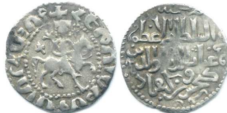
CILICIAN ARMENIA Hetoum I., 1226 - 1270.

The Sublime Sultan | Protector of the World and Faith | Kaykhusraw son of Kayqubad. (Struck in Sis, the year seven and | thirty | - | and six hundred.) Notes: Bears traces of overstrike. Struck over a Seljuq dirham of Kayqubad from the Konya mint, from about 630's A.H..