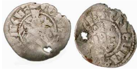
CILICIAN ARMENIA LEVON IV – 1320-1342

...ՆԵԱԼ Ի ՔԱՂ... “Struck in the city of Sis”