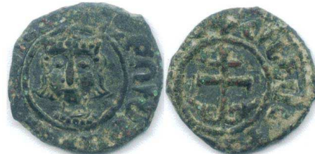
CILICIAN ARMENIA HETOUM II – 1289-1293, 1295-1296, 1299-1301, 1301-1306

...ԹՈՒՄ ԹԱԳԱՒ... “Hetoum King of Armenians”