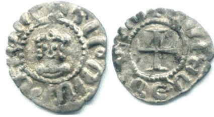
CILICIAN ARMENIA HETOUM II – 1289-1293, 1295-1296, 1299-1301, 1301-1306