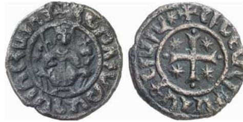
CILICIAN ARMENIA Hetoum I., 1226 - 1270.

+ՇԻՆԵԱԼ Ի ՔԱՂԱՔՆ Ի ԱԻԱ “Struck in the city of Ayas”