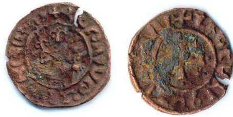
CILICIAN ARMENIA Hetoum I., 1226 - 1270.