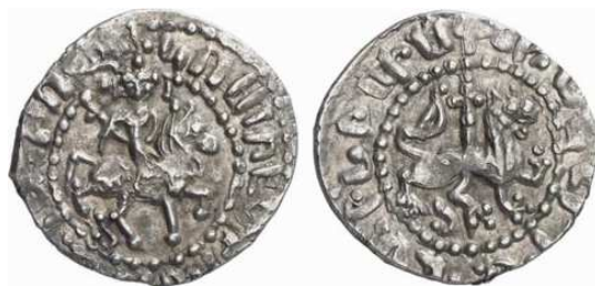
CILICIAN ARMENIA GOSDANTIN IV – 1365-1373

+ՇԻՆ ... Ի Ս “Struck in the city of Sis”