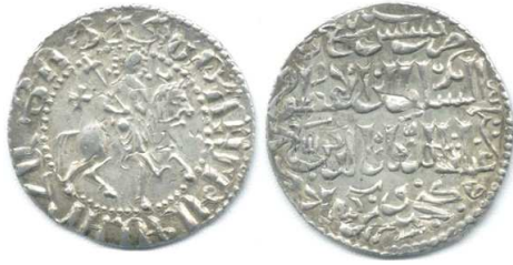
CILICIAN ARMENIA Hetoum I., 1226 - 1270.

Dram. Hetoum I citing Kaykhusraw II, A.H. 637/A.D 1239, 2.96 g.