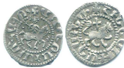
CILICIAN ARMENIA Oshin, 1307-1320.

*Note the error in the spelling of the kings name. It reads: ՍԻՇԻ, but it should read ՍԻՇԻՆ. Missing the letter Ն in the end.