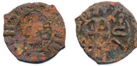
CILICIAN ARMENIA HETOUM II – 1289-1293, 1295-1296, 1299-1301, 1301-1306 AE Kardez, Sis mint. 20 mm

Estimate: 25 EUR. Price realized: 40 EUR (approx. 61 U.S. Dollars as of the auction date)