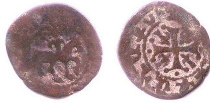
CILICIAN ARMENIA Smbat, 1269-1298.

+ ԿԱՐՈՂՈՒԹԲՆ ԱԱՏ... “By the Will of God”