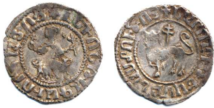
CILICIAN ARMENIA Levon I – 1199-1219

Half Double Dram. (Pre 1199 from Tarsus mint?) 22 mm.