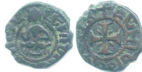
CILICIAN ARMENIA LEVON III – 1301-1307

~ These Kardez' are very distinct due to their workmanship and completeness of inscription. Most types in this series are much more crude and struck with carelessly engraved dies.