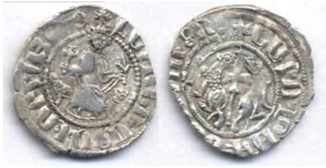
CILICIAN ARMENIA Levon I – 1199-1219