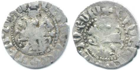
CILICIAN ARMENIA LEVON IV – 1320-1342