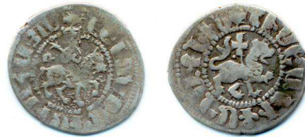
CILICIAN ARMENIA LEVON IV – 1320-1342

+ՇԻՆԵԱԼ Ի ՔԱՂԱՔՆ Ի Ս “Struck in the city of Sis”