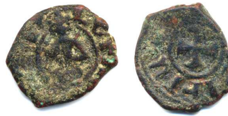
CILICIAN ARMENIA LEVON III – 1301-1307