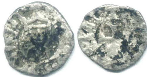
CILICIAN ARMENIA Levon V., 1374-1375.

AE "Billon." 15 mm, 1.00 gm. Wrong metal, unique.