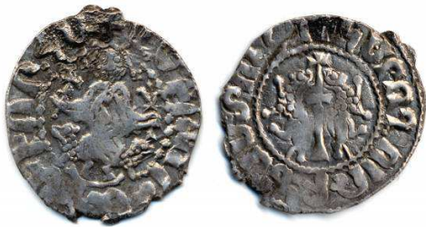
CILICIAN ARMENIA Smbat, 1269-1298.

Notes: There are circles in the field, and between the cross and first letter in the legend. This is a curious and unknown phenomenon seen on some of Smbat's drams. Only these two have them in the legend as well, most only between the king next to throne's lions. This specimen appears to be a die match to CNG 61, Lot: 2350.