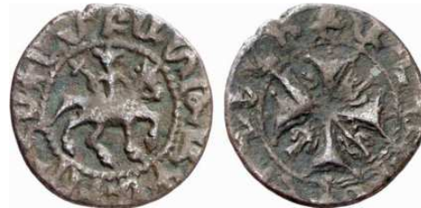
CILICIAN ARMENIA Smbat, 1269-1298.

Estimate: 25 EUR. Price realized: 40 EUR (approx. 61 U.S. Dollars as of the auction date)