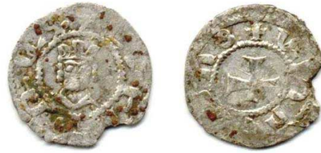
CILICIAN ARMENIA Levon V., 1374-1375.

Estimate: 50 EUR. Price realized: 360 EUR (approx. 552 U. S. Dollars as of the auction date)