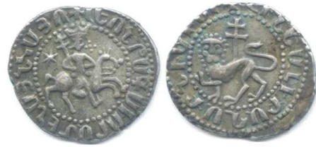
CILICIAN ARMENIA LEVON II – 1270-1289

+ՇԻՆԵԱԼ Ի ՔԱՂԱՔՆ Ի ԱԻԱ “Struck in the city of Ayas”