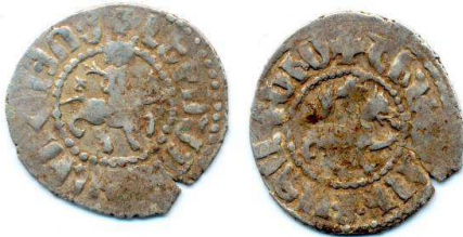
CILICIAN ARMENIA LEVON IV – 1320-1342

+ՇԻՆԱԼ Ք[ԱՂԱ]ՔՆ ՄԻՍ “Struck in the city of Sis”