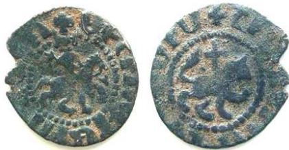
CILICIAN ARMENIA Oshin, 1307-1320.

On his death on July 20, 1320, Oshin was succeeded by his minor son Leo V. Oshin was popularly believed to be poisoned by his cousin (and brother-in-law) Oshin of Corycos.