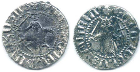
CILICIAN ARMENIA Gosdantin I – 1299