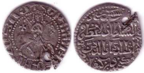
CILICIAN ARMENIA Hetoum I., 1226 - 1270.

Dram. Citing Kaykhusraw II, A.H. 637/AD 1239 22-23 mm