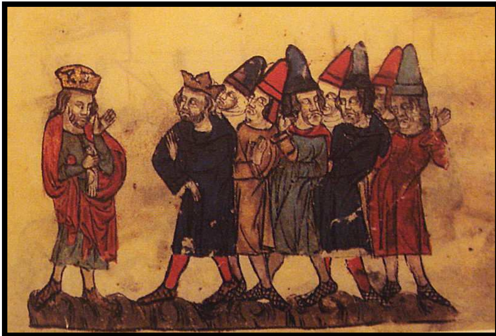
Hetoum II (left) parting from Ghazan and his Mongols in 1303.

In 1307, Hetoum II and Leon III were assassinated by the Mongol general of Cilicia, Bilarghu, following an internal plot against Hetoum's efforts to unite the Armenian Church with Rome.