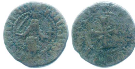
CILICIAN ARMENIA Gosdantin I – 1299

+ԿԱՐՈ ... ԹԲՆ ԱՅ Ե ԹԱԳԱԻՈՐ “By the Will of God is he King”