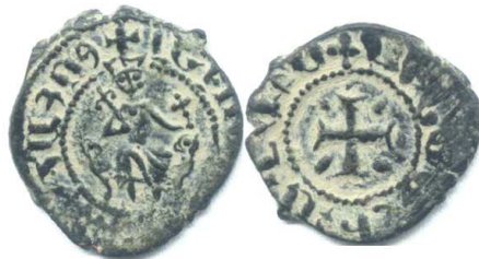
CILICIAN ARMENIA LEVON III – 1301-1307