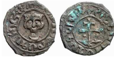
CILICIAN ARMENIA HETOUM II – 1289-1293, 1295-1296, 1299-1301, 1301-1306 Kardez. Sis mint. 3.56 g.