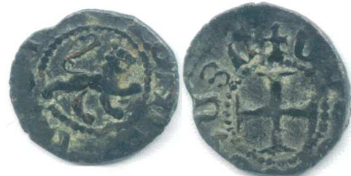
CILICIAN ARMENIA Levon V., 1374-1375.