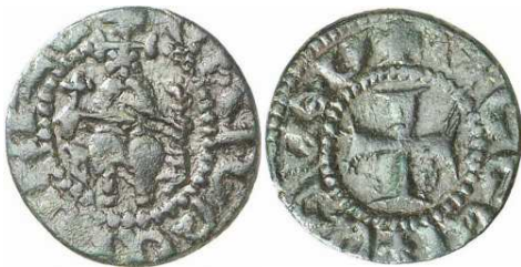
CILICIAN ARMENIA LEVON IV – 1320-1342

+ՇԻՆԵԱԼ Ի ՔԱՂԱՔՆ Ի Ս “Struck in the city of Sis”