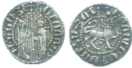
CILICIAN ARMENIA Hetoum I., 1226 - 1270.