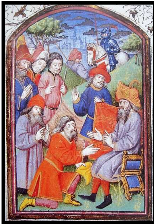
Hetoum I (seated) in the Mongol court of Karakorum, "receiving the homage of the Mongols".[1] Miniature from "Histoire des Tartars", Hayton of Corycus, 1307.

Hetoum abdicated in 1270 in favor of his son Leo II, and lived out the rest of his life in a monastery, as a Franciscan monk.