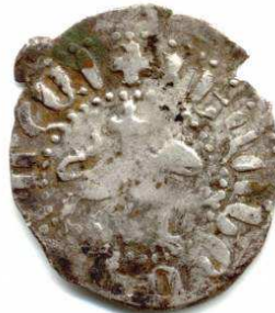
CILICIAN ARMENIA LEVON THE USURPER – 1363-1365