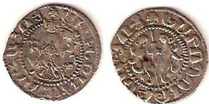
CILICIAN ARMENIA Oshin, 1307-1320.