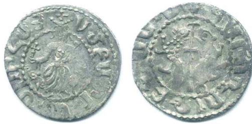
CILICIAN ARMENIA Smbat, 1269-1298.

+ ԿԱՐՈՂՈՒԹԲԼ ԱՍՏՈՒԾՈ “By the Will of God”