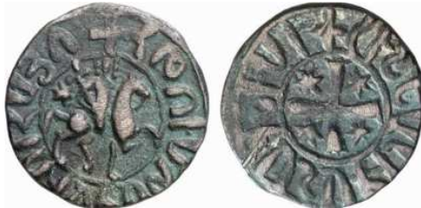
CILICIAN ARMENIA Hetoum I., 1226 - 1270.

+ՇԻՆԵԱԼ Ի ՔԱՂԱՔՆ Ի ՍԻՍ "Struck in the city of Sis"