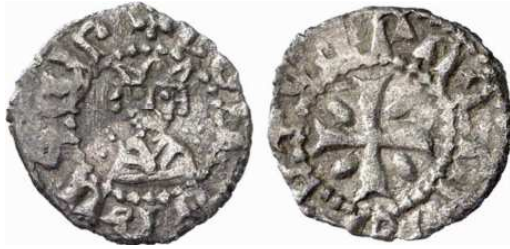
CILICIAN ARMENIA Levon V., 1374-1375.