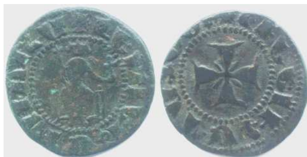
CILICIAN ARMENIA LEVON IV – 1320-1342

+ՇԻՆԵԱԼ Ի ՔԱՂԱՔՆ ՄԻ “Struck in the city of Sis”