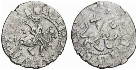
CILICIAN ARMENIA LEVON III – 1301-1307