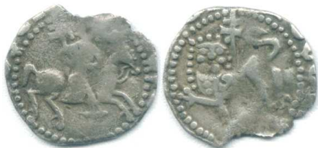
CILICIAN ARMENIA LEVON II – 1270-1289

... ՆԵԱԼ Ի ՔԱՂԱՔՆ ... “Struck in the city of Sis”