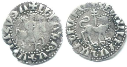
CILICIAN ARMENIA LEVON II – 1270-1289