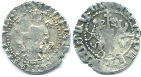
CILICIAN ARMENIA Smbat, 1269-1298.