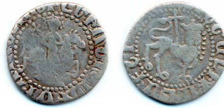
CILICIAN ARMENIA LEVON II – 1270-1289

+ՇԻՆԵԱԼ Ի ՔԱՂԱՔՆ Ի ՄԻՍ “Struck in the city of Sis”