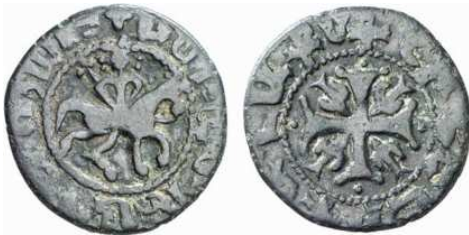
CILICIAN ARMENIA Smbat, 1269-1298.

...ՔԱՂԱՔ ՄԻ... “Struck in the city of Sis”