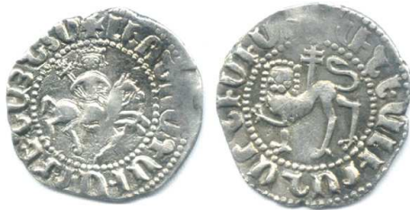
CILICIAN ARMENIA LEVON II – 1270-1289

+ՇԻՆԵԱԼ Ի ՔԱՂԱՔՆ Ի ՍԻՍ Ի “Struck in the city of Sis”