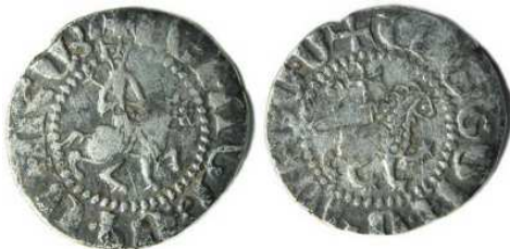
CILICIAN ARMENIA LEVON III – 1301-1307

Notes: Note the fine quality of engraving on the coin, yet a very odd, and partially illegible inscription. Perhaps made by illiterate or foreign die-makers.