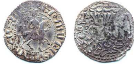
CILICIAN ARMENIA Hetoum I., 1226 - 1270.

(Struck in Sis, the year seven and | thirty | - | and six hundred.) Notes Bears some traces of overstrike. Probably struck over a Seljuq dirham of Kayqubad from the Konya mint.