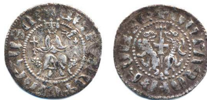
CILICIAN ARMENIA Oshin, 1307-1320.

Estimate: 100 EUR. Price realized: 400 EUR (approx. 613 U.S. Dollars as of the auction date)