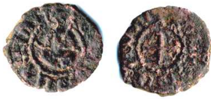
CILICIAN ARMENIA LEVON III – 1301-1307