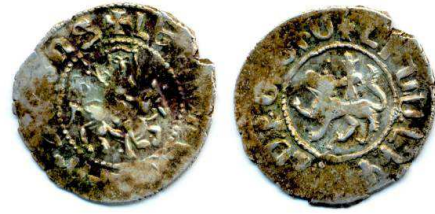
CILICIAN ARMENIA LEVON IV – 1320-1342

+ՇԻՍԵԱԼ Ի ՔԱՂԱՔ ՄԻՍ “Struck in the city of Sis”