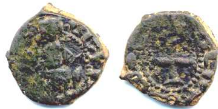
CILICIAN ARMENIA LEVON III – 1301-1307

+ՇԻՆԵԱԼ ՔԱՂԱՔՆ Ի ՄԻՍ “Struck in the city of Sis”