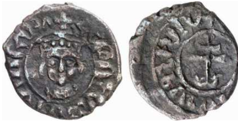
CILICIAN ARMENIA HETOUM II – 1289-1293, 1295-1296, 1299-1301, 1301-1306 Kardez. Sis mint. 4.69 g.