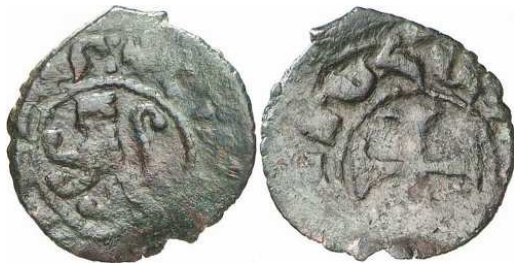
CILICIAN ARMENIA Levon V., 1374-1375.