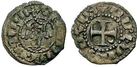
CILICIAN ARMENIA HETOUM II – 1289-1293, 1295-1296, 1299-1301, 1301-1306