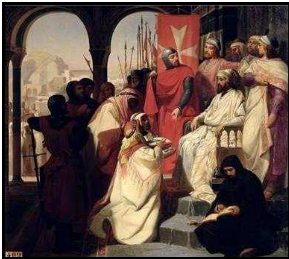
Constantin III of Armenia on his throne with the Hospitallers. "Les chevaliers de Saint-Jean-de-Jerusalem rétablissant la religion en Arménie" ("The knights of Saint-John of Jerusalem reestablish the religion in Armenia"), 1844 painting by Henri Delaborde.

Constantine was the first husband of Maria, daughter of Oshin of Corycos and Jeanne of Anjou. He was predeceased by his two sons. Upon his death from natural causes he was succeeded by his cousin Constantine IV.