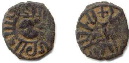
CILICIAN ARMENIA HETOUM II – 1289-1293, 1295-1296, 1299-1301, 1301-1306 AE Kardez with Arabic O/S, Sis mint host. 19-22 mm

Obverse: King seated in oriental style, holding mace in hand (?). Arabic overstrike on top third of coin.