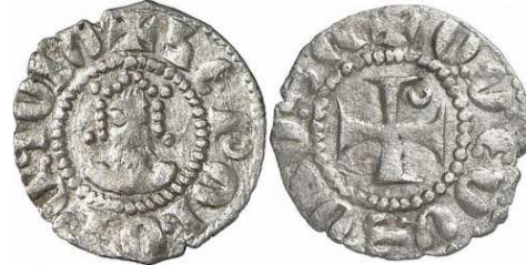
CILICIAN ARMENIA HETOUM II – 1289-1293, 1295-1296, 1299-1301, 1301-1306