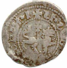
CILICIAN ARMENIA LEVON THE USURPER – 1363-1365