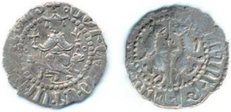
CILICIAN ARMENIA Smbat, 1269-1298.