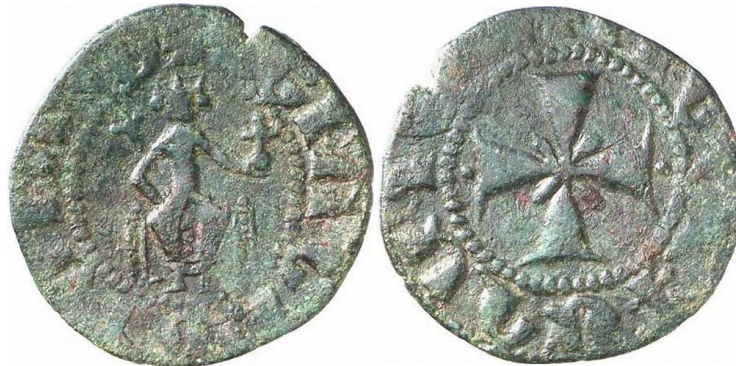
CILICIAN ARMENIA HETOUM II – 1289-1293, 1295-1296, 1299-1301, 1301-1306

Estimate: 50 EUR. Price realized: 50 EUR (approx. 77 U.S. Dollars as of the auction date)