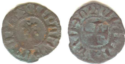
CILICIAN ARMENIA HETOUM II – 1289-1293, 1295-1296, 1299-1301, 1301-1306