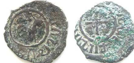
CILICIAN ARMENIA LEVON II – 1270-1289

Reverse: Lion standing to the left, patriarchal cross with two bars behind.