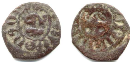
CILICIAN ARMENIA HETOUM II – 1289-1293, 1295-1296, 1299-1301, 1301-1306

+ՇԻՆԵ ... ԱՔԻ “Struck in the city of Sis”