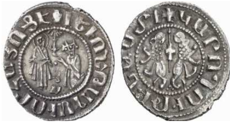
CILICIAN ARMENIA Levon I – 1199-1219